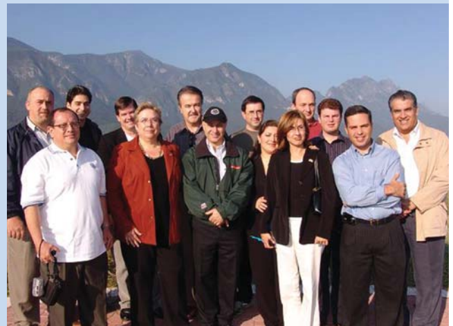
The delegation of Canadian manufacturers in Mexico.